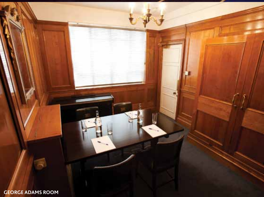
GEORGE ADAMS ROOM