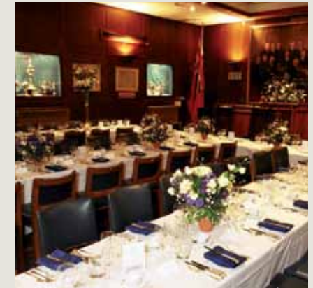
The top table