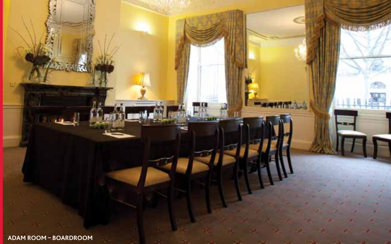
ADAM ROOM – BOARDROOM