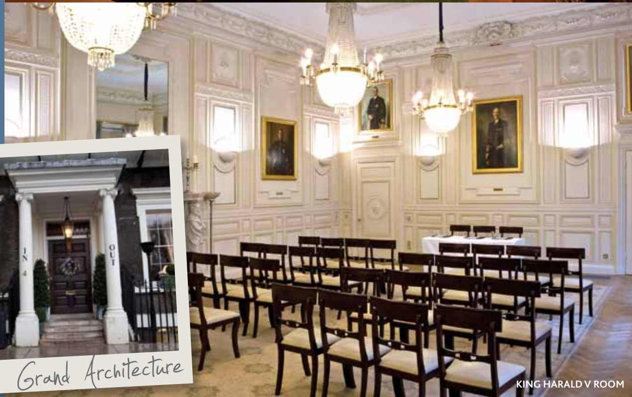
KING HARALD V ROOM